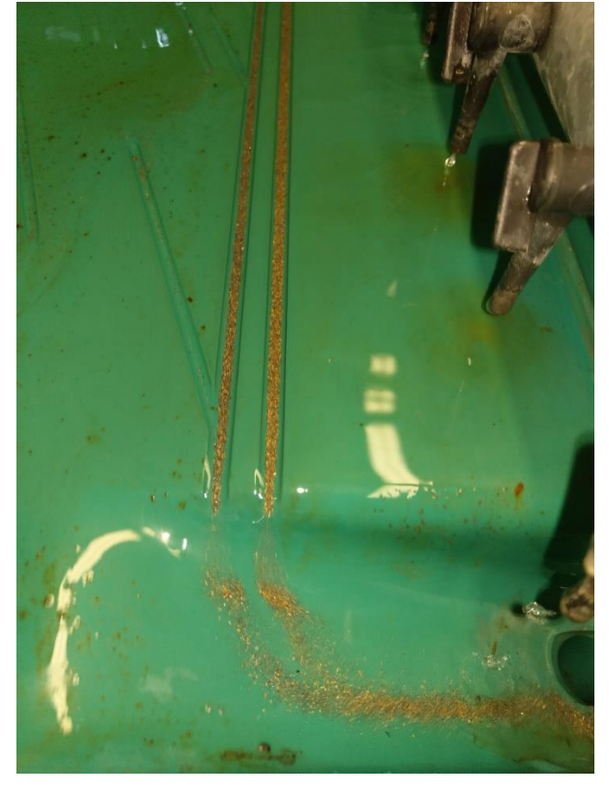
Photo 2. Gold room: Gold concentrate after multiple passes on the gravity separation table