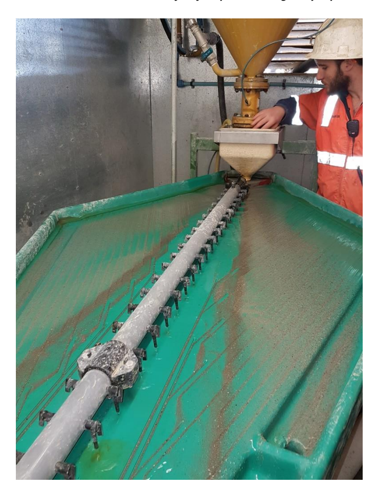
Photo 3. Gold room: Gold concentrate after first pass on the gravity separation table