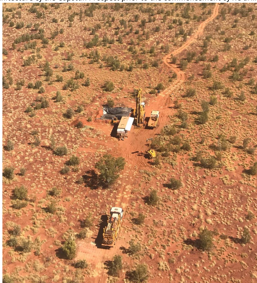
Figure 1. Diamond drill rig at the Capstan Prospect commencing bedrock drilling

The next phase of exploration is now underway. Diamond drilling will assist in understanding the geological architecture of the Capstan Prospect prior to the commencement of RC drilling."