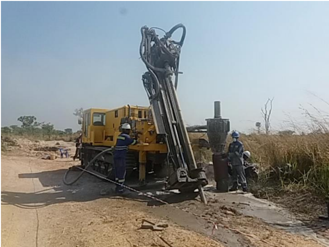
Figure 6: RC Drilling at the Kanuka Lithium Production Project in the DRC

The diamond drilling program will consist of up to 1,000m of PQ/HQ drilling and is expected to add valuable geological and structural information to assist in constraining the RC drilling and geochemistry information and further add to our geological understanding of the Kanuka Lithium Production Project.