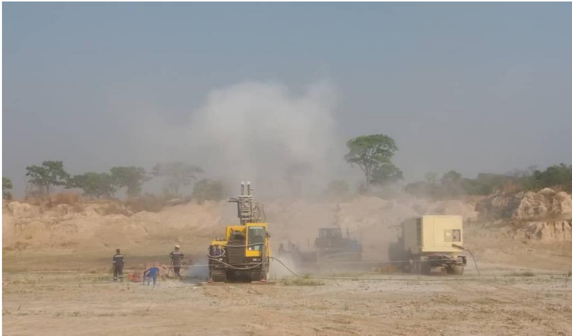
Figure 1: RC Drilling at the Kanuka Lithium Production Project in the DRC