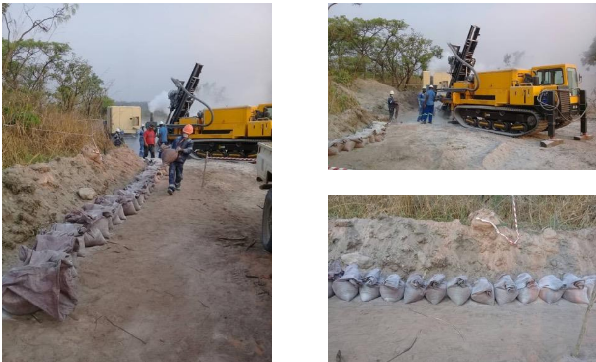
Figure 3, 4 and 5: RC Drilling and Samples at the Kanuka Lithium Production Project in the DRC

Samples from the first 21 RC drill holes have been dispatched to ALS in Lubumbashi for sample preparation and then to Johannesburg for multi-element analytical determinations. The first drill assay results are expected to be received within 3 to 4 weeks.