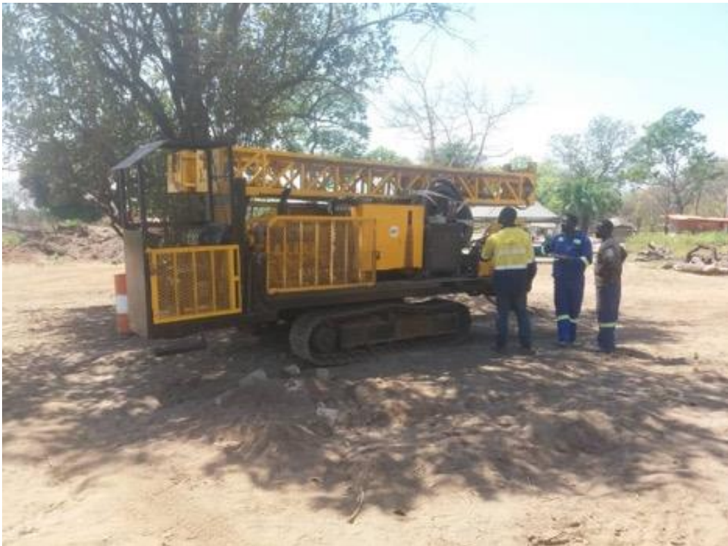
Figure 8: Diamond Drill Rig at the Kanuka Lithium Production Project in the DRC