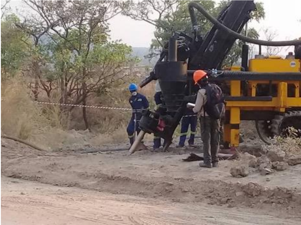
Figure 7: RC Drilling at the Kanuka Lithium Production Project in the DRC