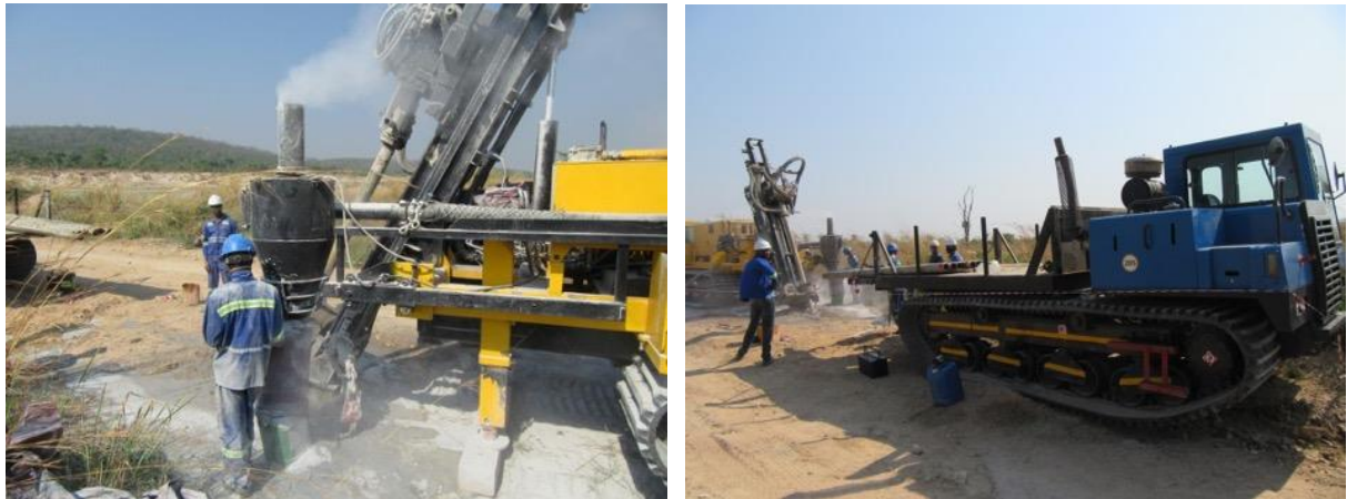
Figure 2: Drilling Activities Concluding at KLJV022 at the Kanuka Lithium Production Project