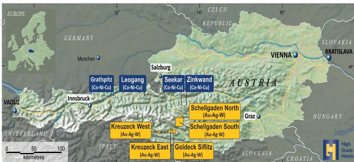
Figure 1. Location of High Grade Metals' Projects within Austria

High Grade Metals (ASX: HGM) is an Australian mineral exploration company with a portfolio of brown fields cobalt, copper and gold assets. The Company's major projects are all located in mining friendly Austria, which covers an area of about 84,000 km 2 across Central Europe. The highly experienced management aims to grow the value of HGM's project portfolio to benefit shareholders by leveraging innovation and maximizing value of the assets through systematic exploration and teamwork. The dynamic two-year exploration and development program underpins the Company's business strategy.