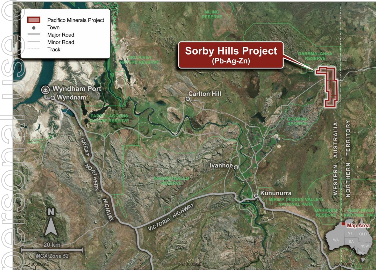
Figure 1. Location of the Sorby Hills Project approximately 50km northeast of Kununurra, Western Australia

Areas selected for initial drilling were reviewed over the last few months by CSA Global Pty Ltd as Pacifico undertook technical due diligence on the Project and then moved to optimise a future work program. Pacifico has concluded that drilling within the existing Inferred Mineral Resource or zones immediately adjacent provide the best option to incorporate an updated resource estimate from this drilling into a Pre-Feasibility Study to be completed in 2019. Within these resources the average depth to the top of mineralisation is 20m below surface, with what appears to be free dig colluvium and upper thin zones of the Knox siltstone.