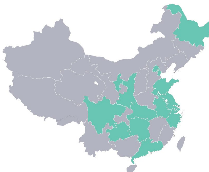
The 15 provinces and districts in China highlighted are covered by current strategic partnerships

Fluence has five (5) smart-packaged Aspiral™ demonstration units and four (4) Aspiral™ plants in China currently operational, 23 distinct partnerships covering districts and regions in 15 provinces, 10 commercial contracts signed and an additional five (5) Aspiral™ installations under construction. These sites serve as important reference points for the efficacy of Fluence's advanced MABR technology to serve this China opportunity.