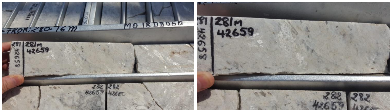
Core samples of MO18DD050 showing existence of spodumene and tin with interval downhole from 281m to 282m reporting 4.28% Li 2 O & 103ppm Sn

AVZ's infill drilling is expected to be completed late in November, with an update to the Mineral Resource Estimate for Manono due before the end of the year.