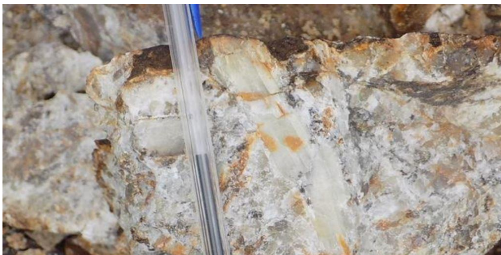
Rock Chip Sample collected showing white spodumene (the large, long prism to right of the blue pen) in a quartz feldspar matrix

The initial metallurgical test work demonstrates the Roche Dure prospect at the Manono Lithium Project can produce up to 6.3% Li 2 O DMS concentrate (+3.35mm) using standard metallurgical laboratory test standards.