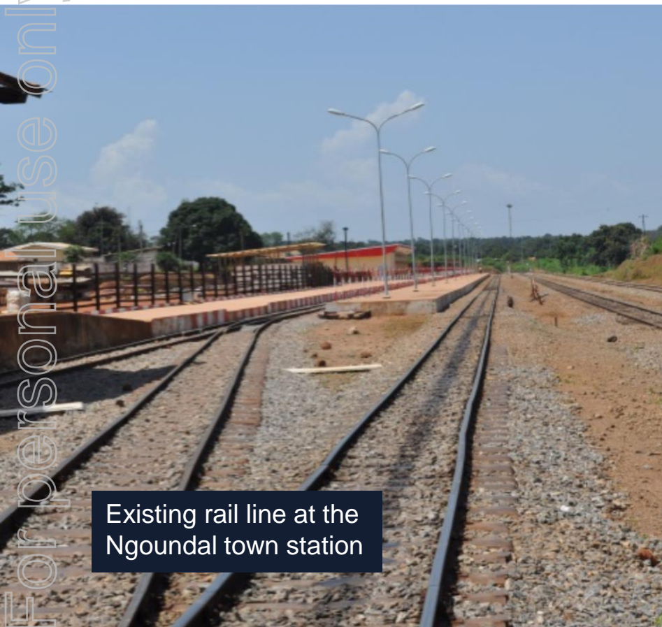
Existing rail line at the Ngoundal town station