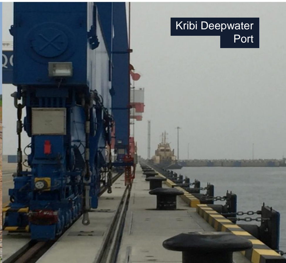
Kribi Deepwater Port