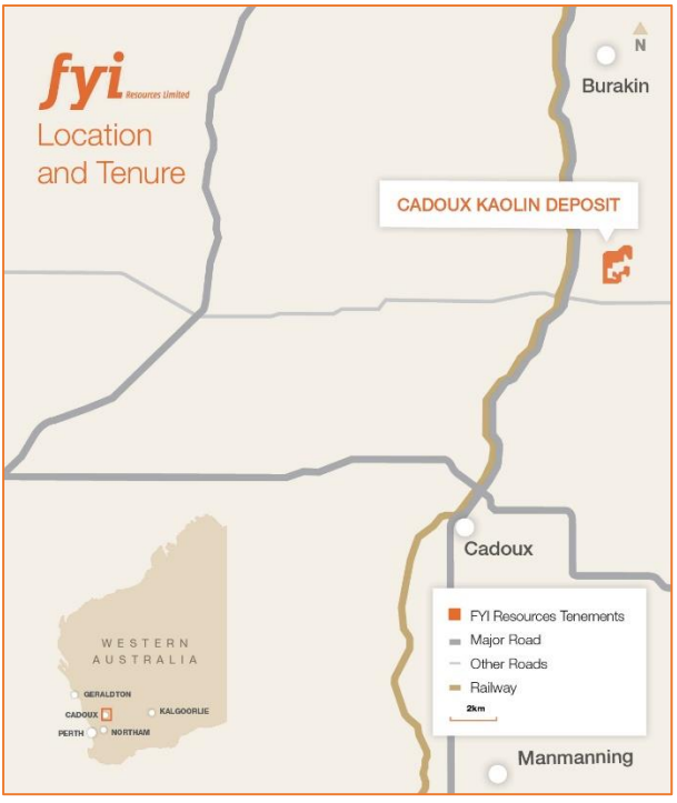
FYI's Cadoux Kaolin Project location (EL70/4673)