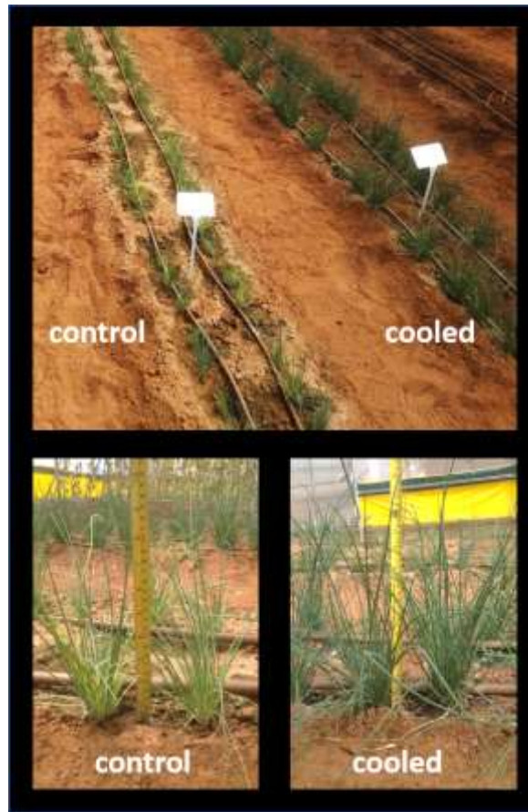
RZTO cooling technology increased the average weight of chives by 257 percent compared to control crops.