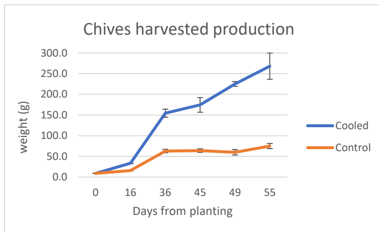
Cooled chives plants (blue) continued growing for 55 days while uncooled plants (orange) virtually stopped growing after 36 days.