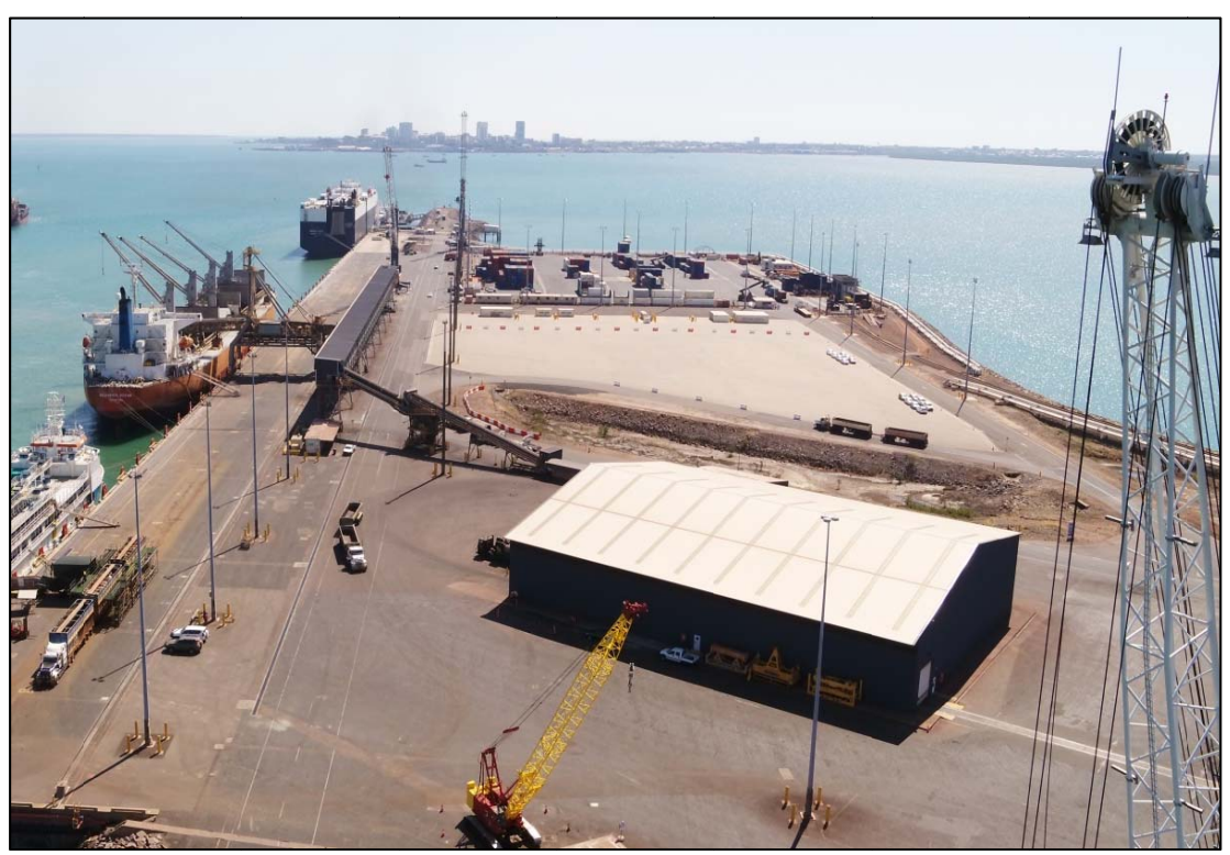
Figure 2 Darwin Port loading facilities (travelling gantry and autoloader)