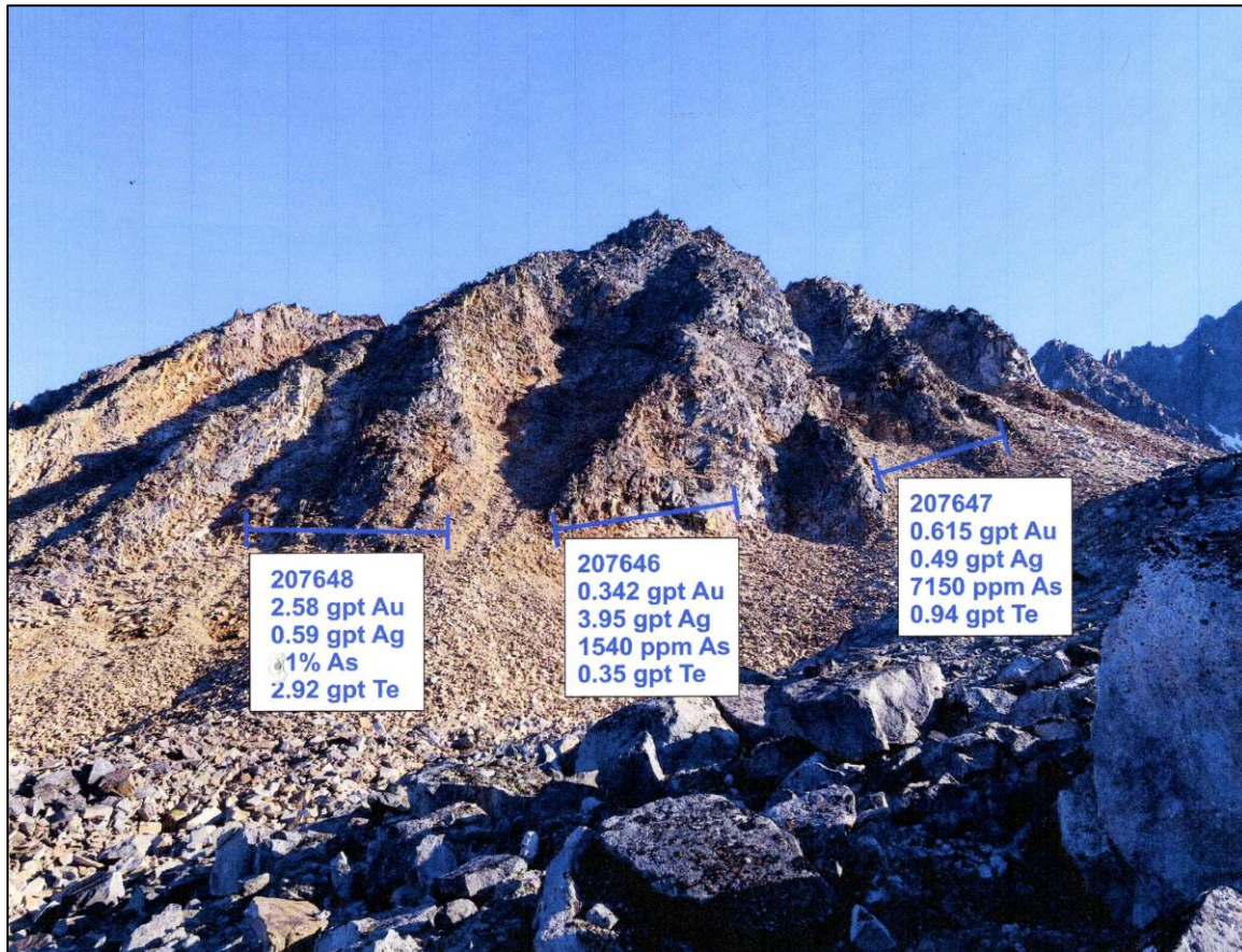
Figure 2: Significant alteration zone and gold anomalies at Oxide South

Due to unexpected delays with the commencement of the drilling program and winter setting in earlier than expected, two holes were drilled at the Estelle Oxide prospect (OX18RC001 and OX18RC002).