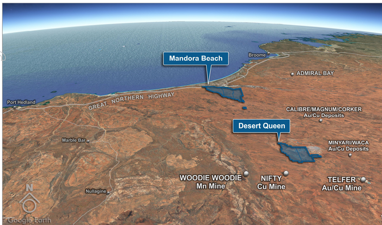
Figure 2: Paterson Copper Project location and copper occurrences