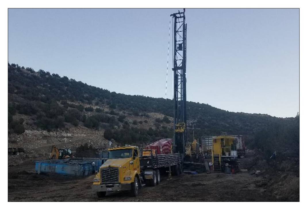
Figure 1 – Drilling Operations Underway on the Powell #23-25 Well

The Company looks forward to providing updates throughout the drilling program as well as updates on the testing of the Amerigo Vespucci #1 well.