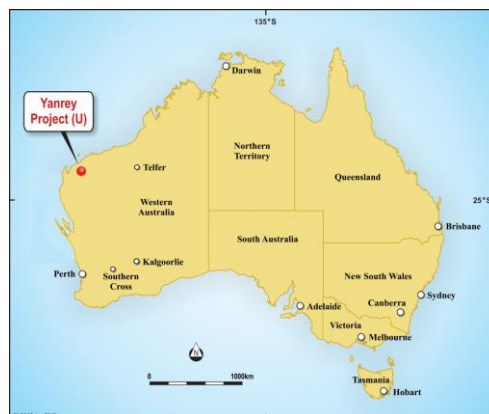
Figure 1: Major Project Locations in Australia

Further field work at Bennet Well is on hold until clarity on Western Australian uranium exploration policy is received from the Minister of Mines and Petroleum.