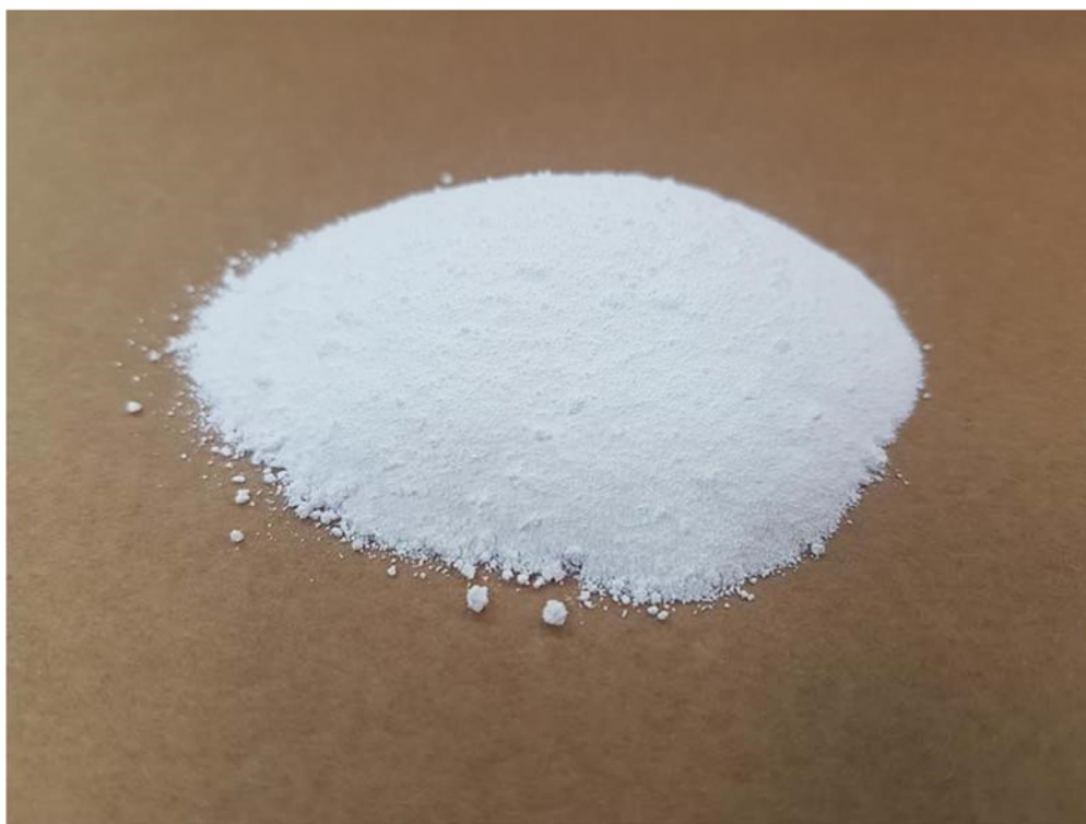
Figure 1 - 4N High Purity Alumina Crystals Produced from Carey's Well Halloysite-Kaolin

BHM undertook three passes on different samples through a standard set of conditions relating to a chloride leach and purification system. These samples were halloysite-kaolin ore with the coarse sand content removed by wet screening. In all instances the material responded with excellent metallurgical response achieving > 90 % aluminium dissolution, and only 1 pass of precipitation purification required to meet the target purity specification.