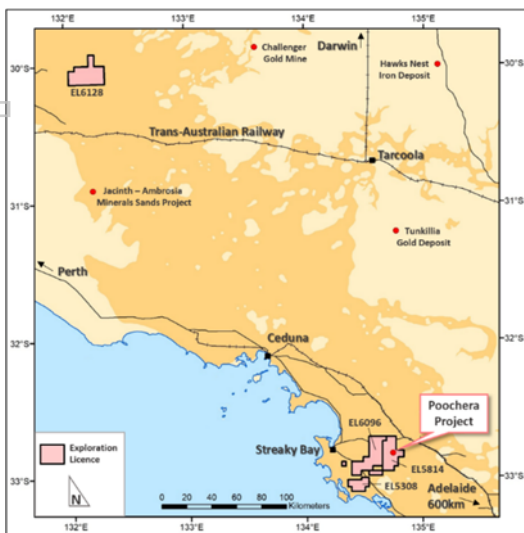
Figure 3 -Project location plan

The Poochera Kaolin-Halloysite Project covers two main geographic areas of interest, both situated in the western province of South Australia (Figure 3). The main area of focus, the Poochera Kaolin-Halloysite Project on the Eyre Peninsula comprises three tenements and is located approximately 635kms west by road from Adelaide and 130kms east from Ceduna (Figure 4).