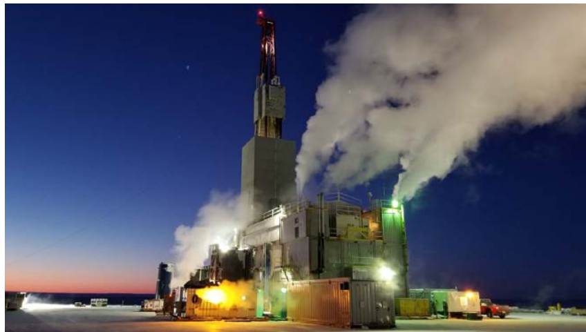
Nordic Rig#3 on location, drilling ahead

The well was drilled to 600ft prior to pulling out of hole to pick up the smart bottom hole assembly with logging while drilling tools attached. At 11:45 17th February (AK time), Nordic Rig#3 was drilling ahead at 880’. The forward plan is to deepen the hole to ~2,500ft before setting surface casing. See schedule attached for additional details.