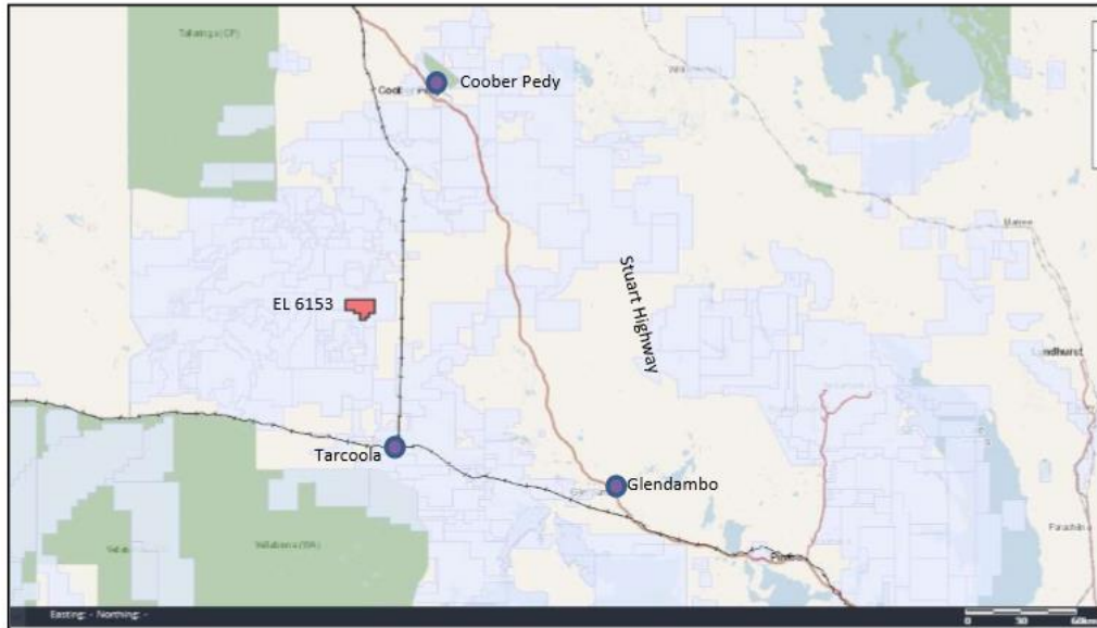
Figure 1. Image from SARIG; showing location of EL 6153, Tarcoola, Glendambo and Coober Pedy. Also shows the train lines and major roads, including the Stuart Highway.