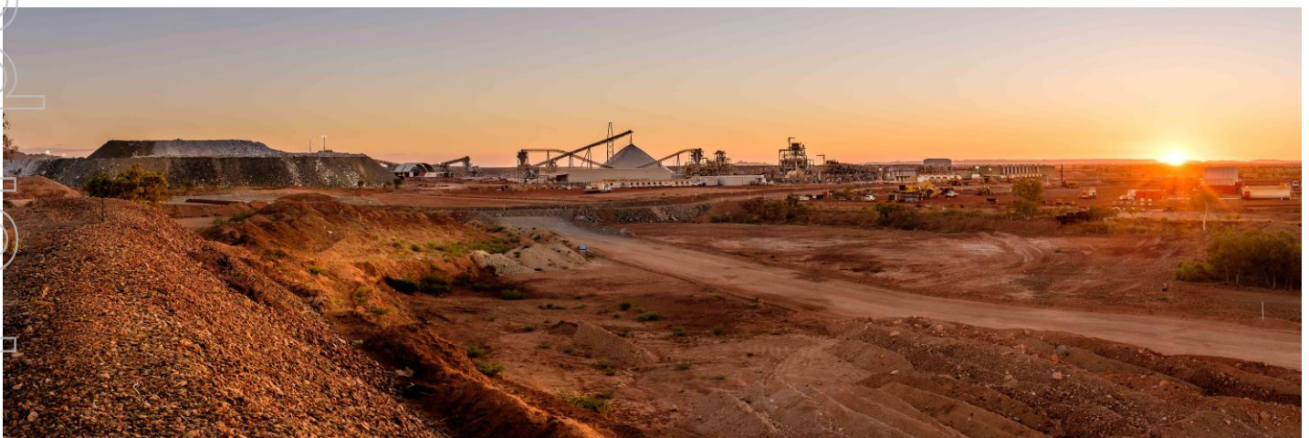
Figure 1: Pilgangoora Lithium-Tantalum Project

"Our participation in downstream chemical conversion facilities is building momentum through the recent exercise of our option to enter into a joint venture with POSCO for a 40ktpa LCE capacity chemical conversion facility in South Korea, as well as the positive scoping study results to evaluate a potential secondary lithium chemical conversion facility. Collectively, these projects have the potential to support further vertical integration of our business and diversify Pilbara Minerals' entrance into this high value market."