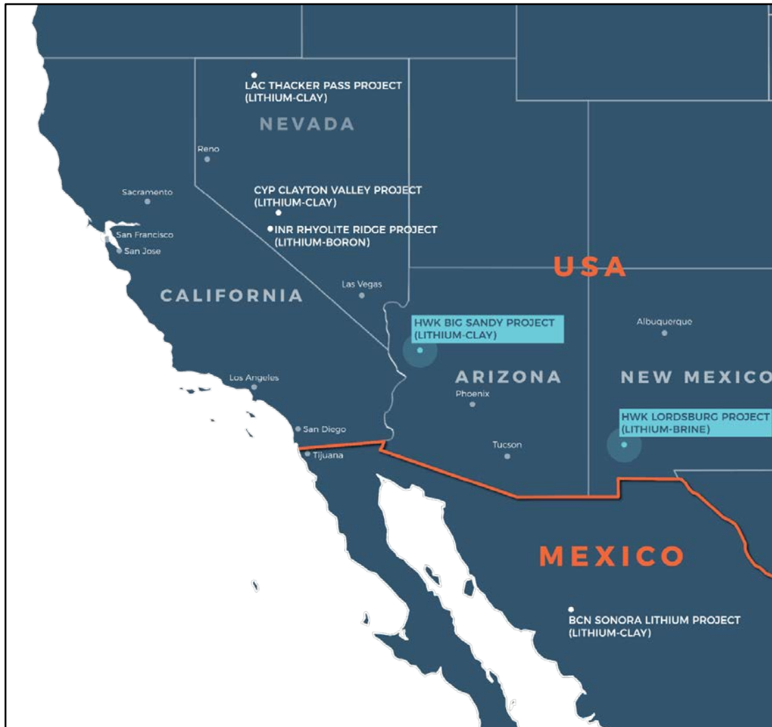
Figure 1 – Location of Hawkstone’s Big Sandy (lithium-clay) and Lordsburg (brine-hosted) Projects.