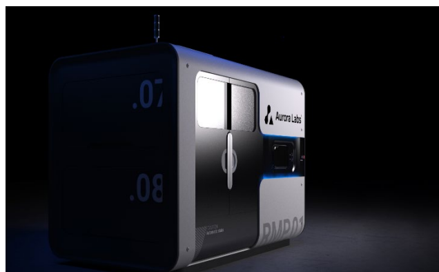
RMP1 Beta Printer