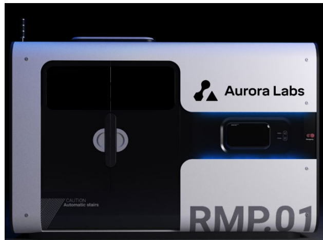
RMP1 Beta Printer

The RMP1 Beta Printer is a pre-production machine which will be almost identical in operation to the Company's final production line machines, with the exception of improvement and changes that come from feedback from customers. The production version of RMP1 will be commercially available in CY2019.