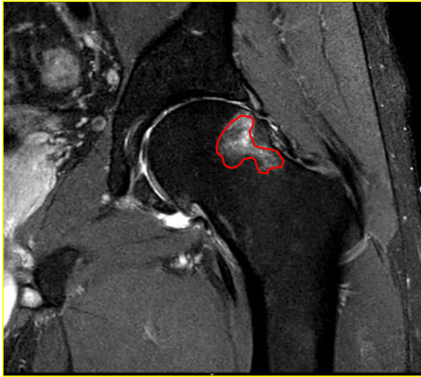
HIP JOINT – close to full regression of BML