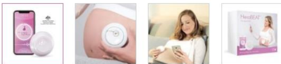
Image two: 'buy now' function on Australian B2C website

Medical grade fetal heart rate monitor for home use. Find and monitor your baby's heartbeat any time, anywhere using the HeraBEAT app.