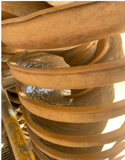
Figure 6: Spirals in operation