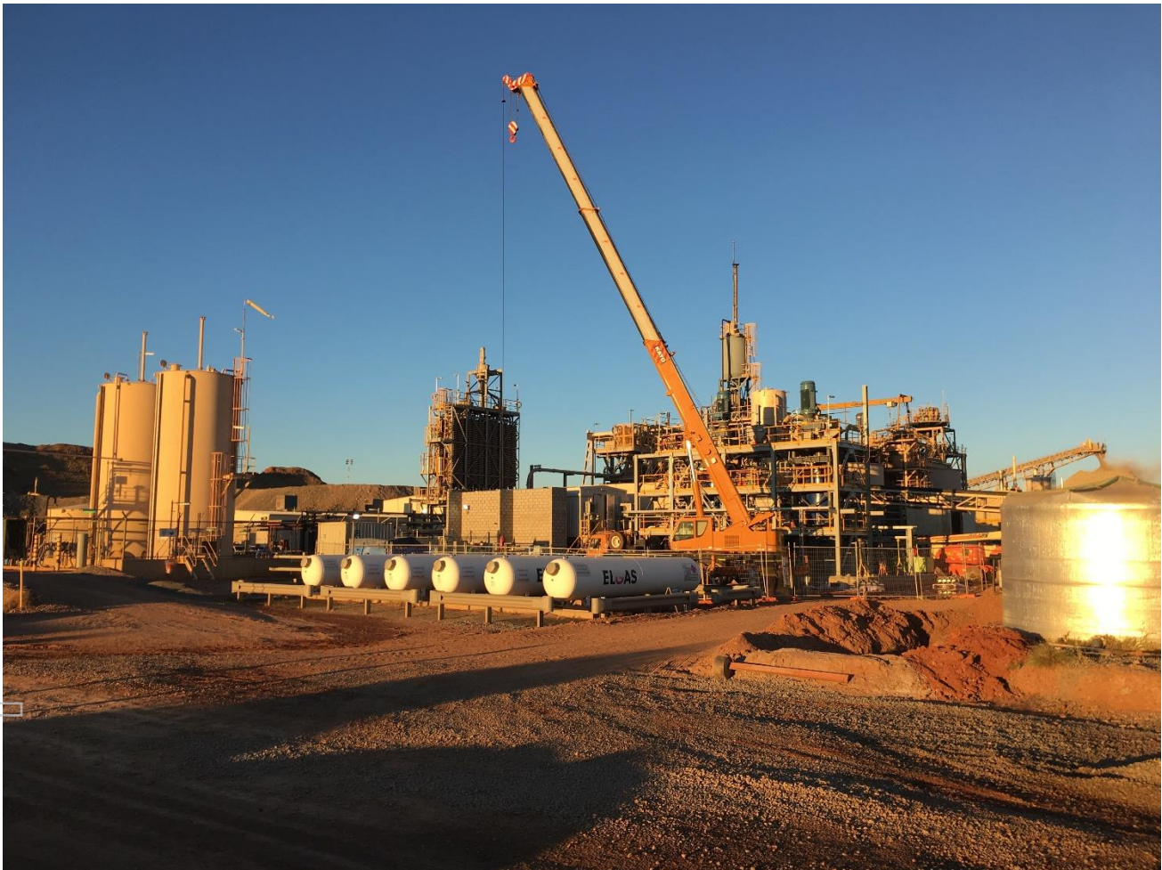
Figure 1: Concentrator and mill area during final stages of construction

For media inquiries, please contact: Kate Bell / Nicholas Read Read Corporate +61 8 9388 1474