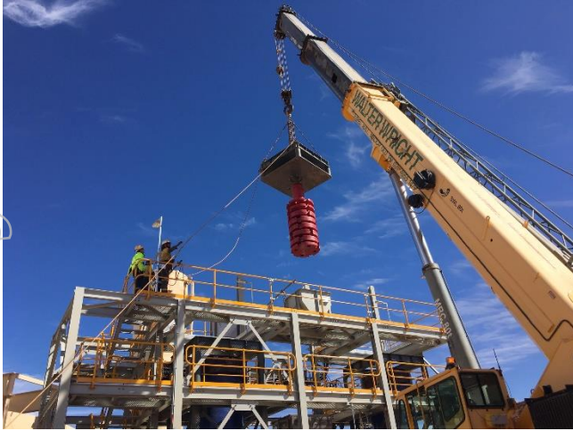
Figure 2: Mill agitator assembly being loaded into the mill shell