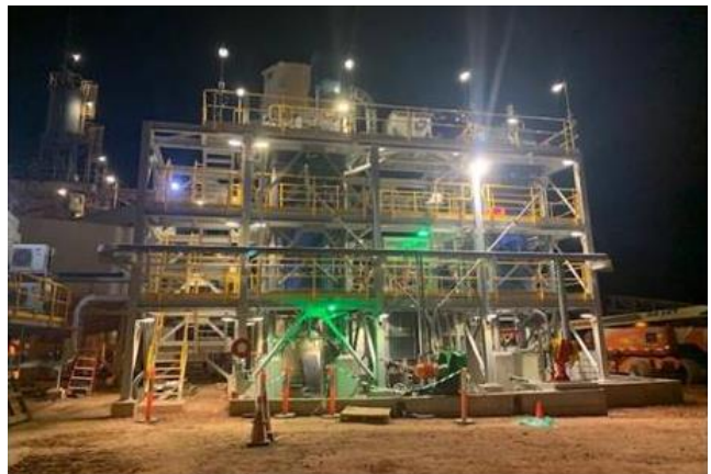
Figure 5: Concentrator and mill area during final stages of construction