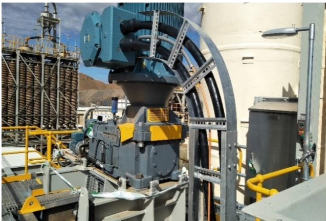
Figure 4: UFG Mill #1 with Spiral concentrator in background