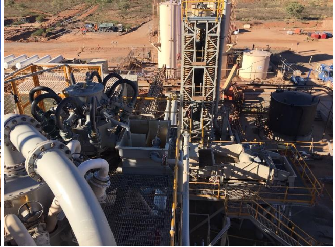
Figure 3: Concentrator circuit showing desliming cyclone clusters with spiral concentrator in background