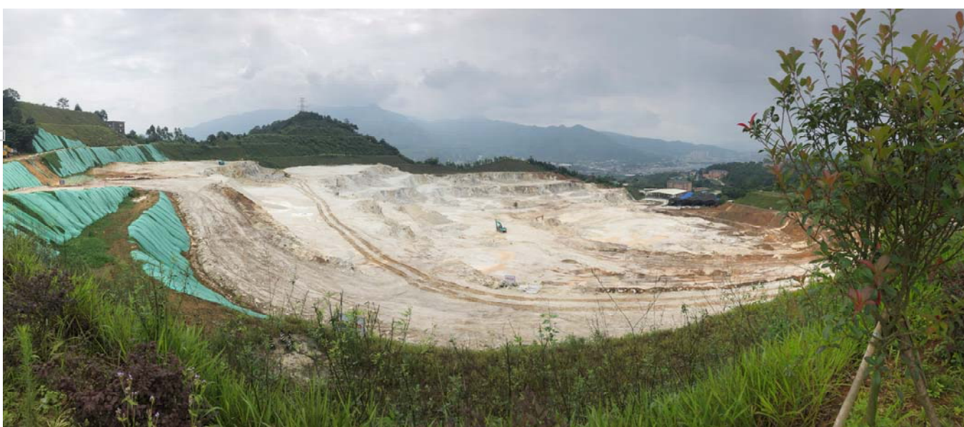
Figure 2 – Chinese kaolin mine requiring Carey's Well ore for production consistency

Additional ceramic industry application testing of DSO and dry-processed material is also in progress with a number of significant companies located in Japan and India, while evaluation of the material as a cracking catalyst for the petrochemical industry is being conducted by a large Chinese company.