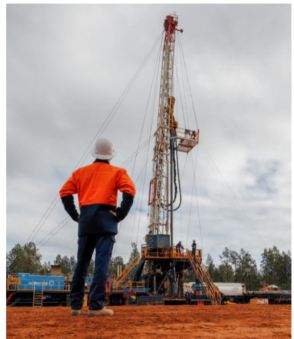
Easternwell rig 27 drilling ahead