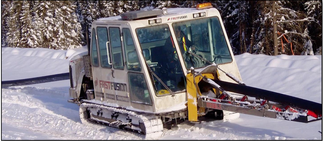
Figure 4 – Proposed Slurry Polyethylene Pipeline Installation

Snow Lake CEO, Derek Knight commented “Snow Lake will look to further de-risk the infrastructure requirements for the delivery of first direct shipping ore to Tanco through these preliminary discussions and site meetings, although not our only option to fast track our development, it certainly is a great opportunity we are pursuing quite rapidly.”