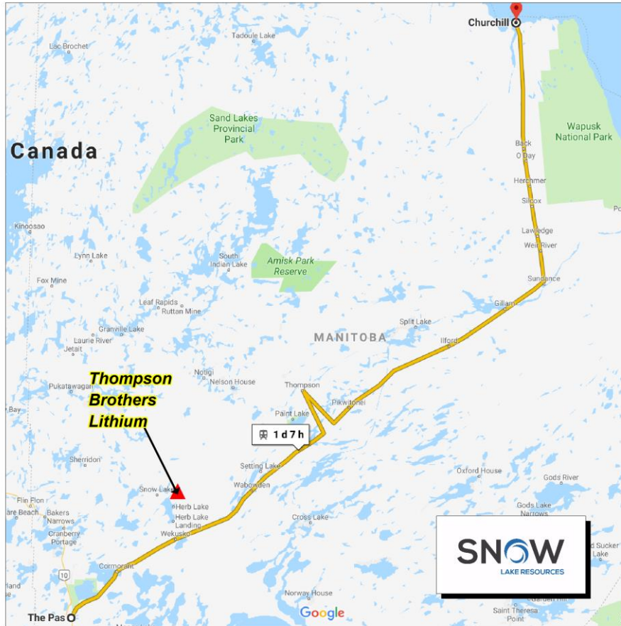
Figure 2 – Rail Distance to Port of Churchill

The Company is committed its fast track development strategy for a low capex, clear pathway to production and cash flow.