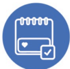
Pregnancy management tools