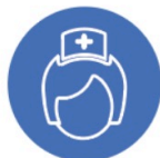
24/7 Midwife Consultancy