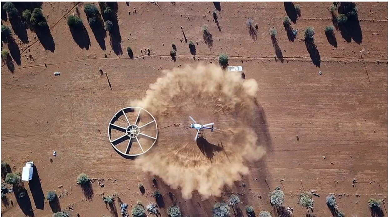
NRG Helicopter - Time domain EM survey data capture Bottle Creek 2019

Challenge Drilling are scheduled to commence an additional 2,500 metres of RC drilling mid November 2019, drilling additional infill resource drilling. The Company expects to deliver a resource upgrade in Q1 2020.