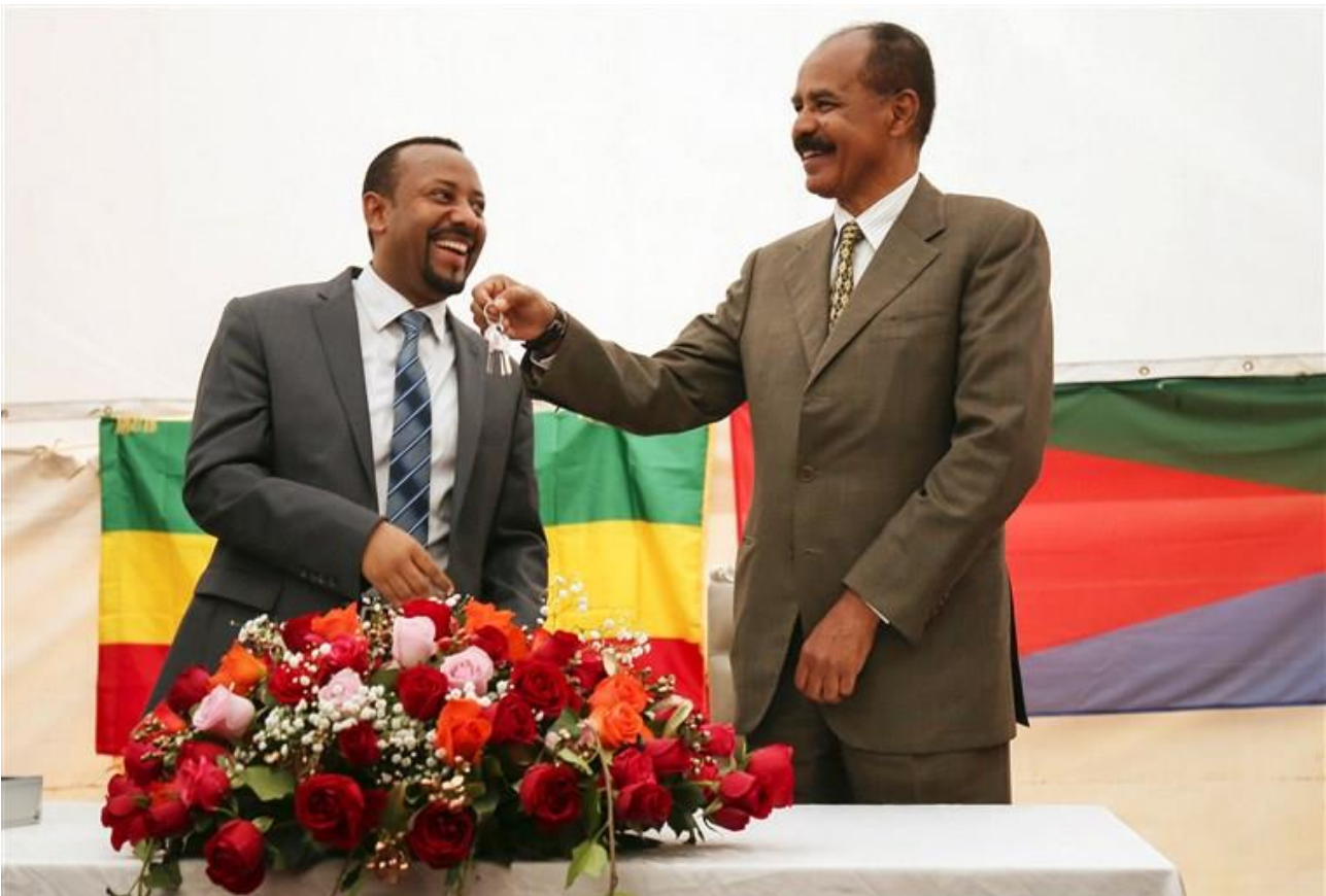
Eritrea's President Isaias Afwerki, right, and Nobel Prize winner Ethiopian Prime Minister Abiy Ahmed