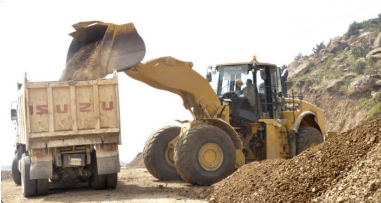
Roadworks in Eritrea; source: www.tesfanews.net/eritrea-road-expansion-modernization-integration/