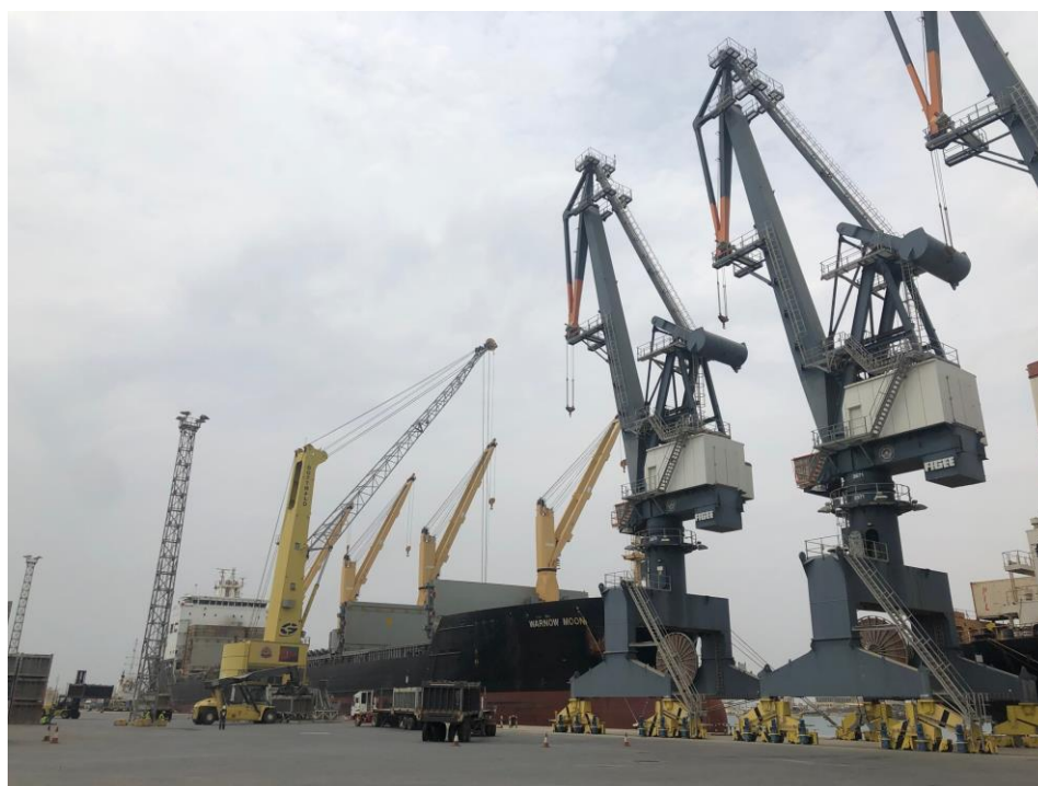
Bisha Mining Share Company loading Zinc and Copper for export at the Port of Massawa

There was no change in tenement holding during the September Quarter 2019.