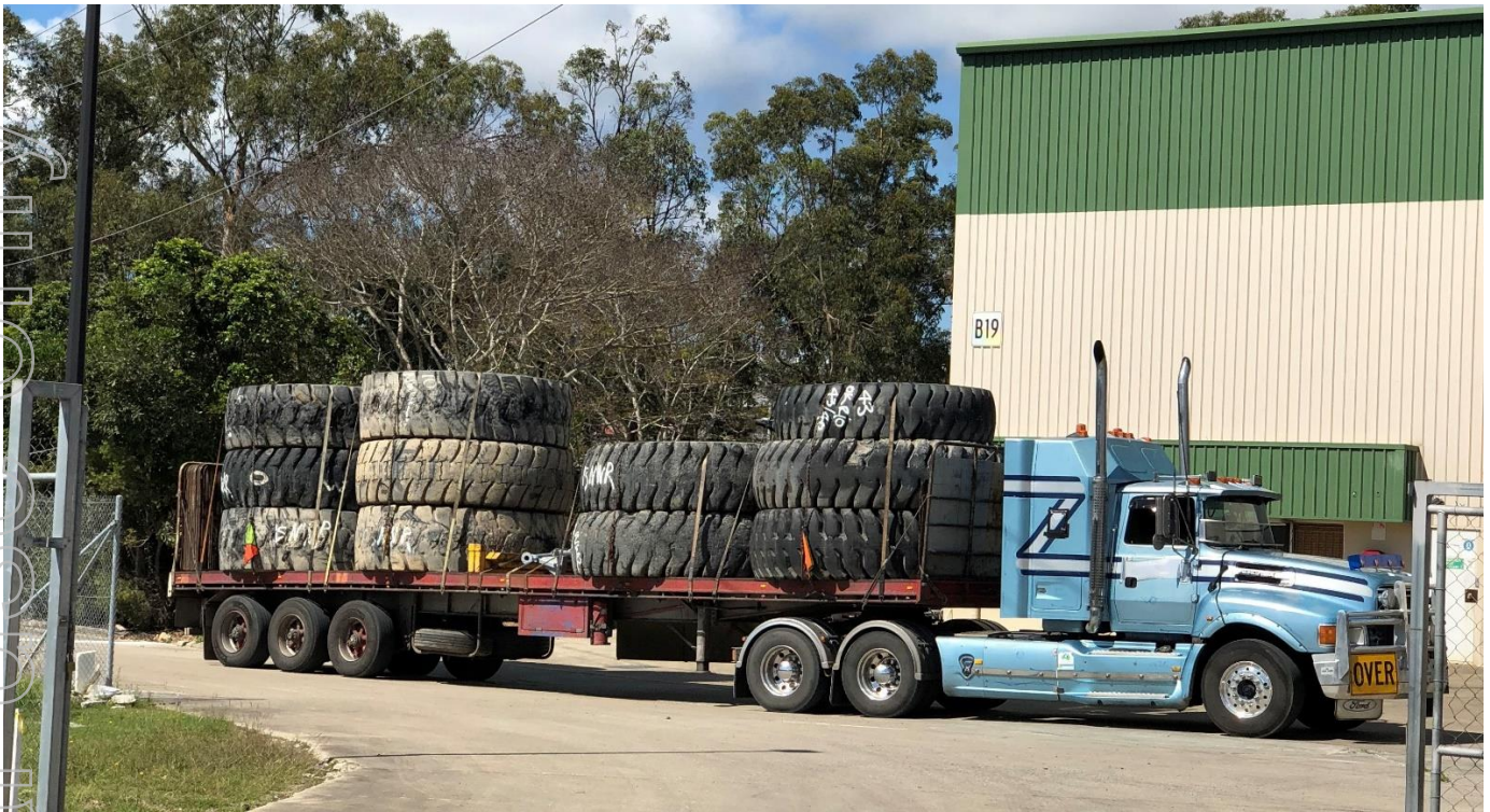
Image 1: Earthmover tyres collected by ATP and being received at Pearls Queensland facility

On 24 th September 2019 the Company announced the completion of the acquisition of end-of-life tyre collector and shredder, ATP. The acquisition is complimentary to Pearl's business and assists with securing a consistent supply of feedstock and capturing greater financial value from the used tyre reclamation process.