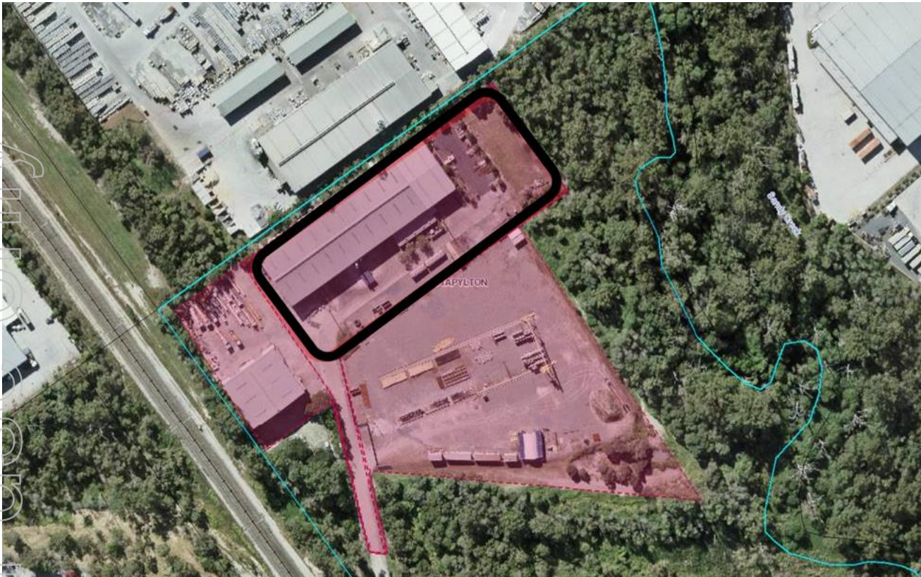
Image 2: Existing and new geographical area for expanded operations

As per image 2 below, Pearl has expanded its Stapylton site area from 6,330m 2 (distinguished by black border) to an occupancy of over 19,500m 2 (being the area in pink encompassing the previous tenancy).