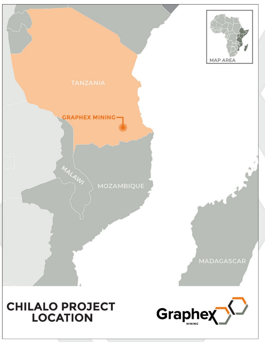
Figure 1 – Chilalo Large Flake Graphite Project, Located in Tanzania

For more information, visit www.graphexmining.com.au.