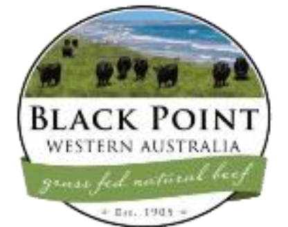
Regenerative farmer partners

Offering long-term supply agreements and support for regenerative farmers