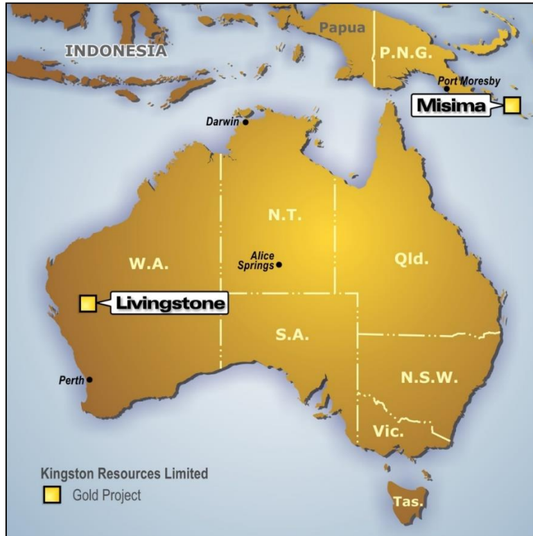
Kingston project locations

In addition, Kingston owns 75% of the high-grade Livingstone Gold Project in Western Australia where active exploration programs are also in progress.