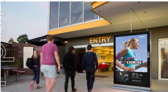
ADLINE CLASSIC - STATIC DISPLAYS