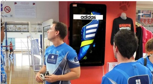
ADLINE ACTIVE- DIGITAL DISPLAYS