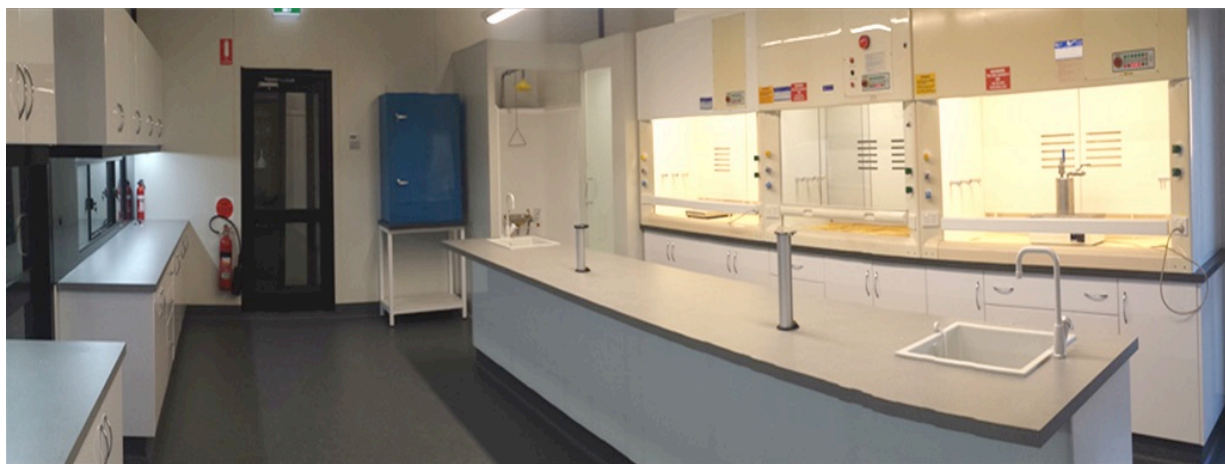
Figure 1: $2.5 million Alcore laboratory built

Alcore operates a sophisticated laboratory in Berkeley Vale, central coast NSW. It is uniquely licensed for high-technology chemical experiments under strictest safety and environmental control systems.