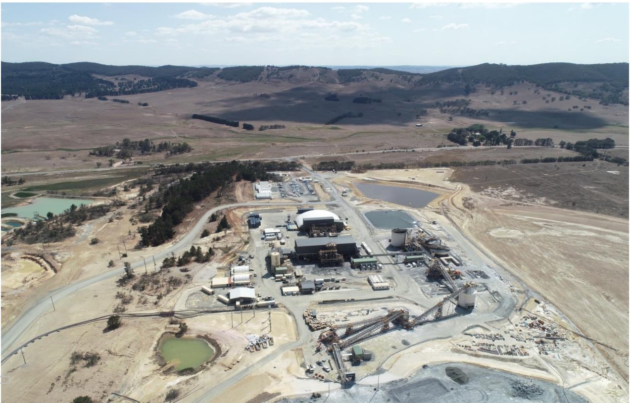
Figure 1 - Woodlawn Processing Plant, with ROM Pad, crusher and fine ore bin in the foreground