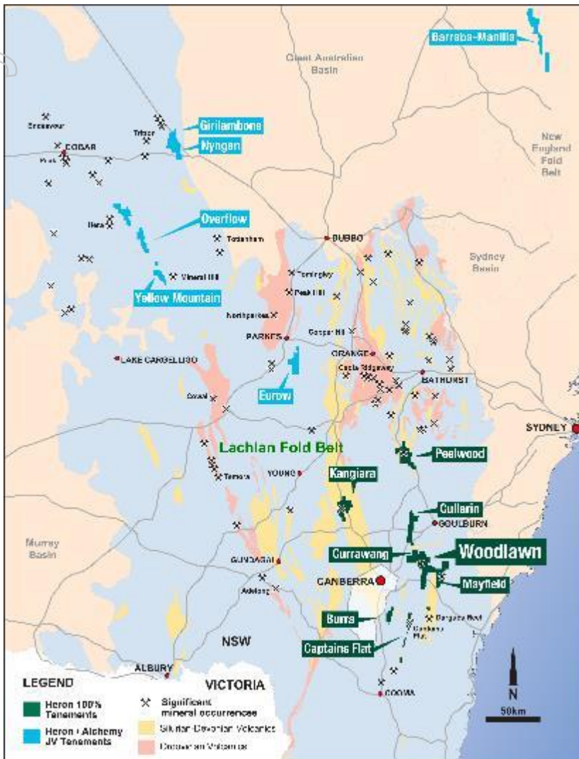
Figure 3 Heron NSW Projects (including Alchemy JV tenure).