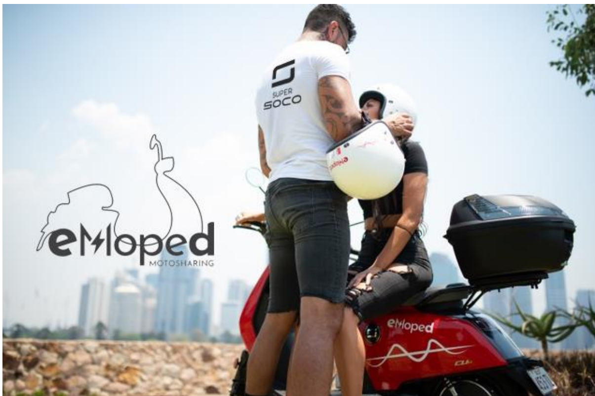
Photo: eMoped launches its rideshare operations in Brisbane, Australia

Vmoto is committed to communicating with the investment community through all available channels including social media. Whilst ASX remains the primary channel for all material announcements and news, all Vmoto shareholders, investors and other interested parties are encouraged to follow Vmoto on website ( www.vmoto.com ), Facebook ( www.facebook.com/vmotosoco ), Instagram ( www.instagram.com/vmotosoco ) and YouTube (Vmoto Soco).