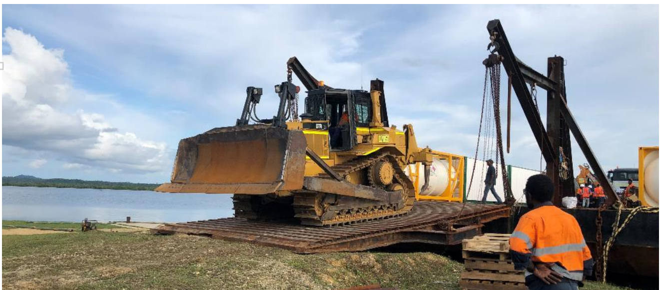
Figure 1: Woodlark Island - Arrival of barge for the commencement of construction and development activities.

Geopacific is now well placed to complete a Civil Works Program designed to facilitate project execution in preparation for the construction of the process plant by GR Engineering”