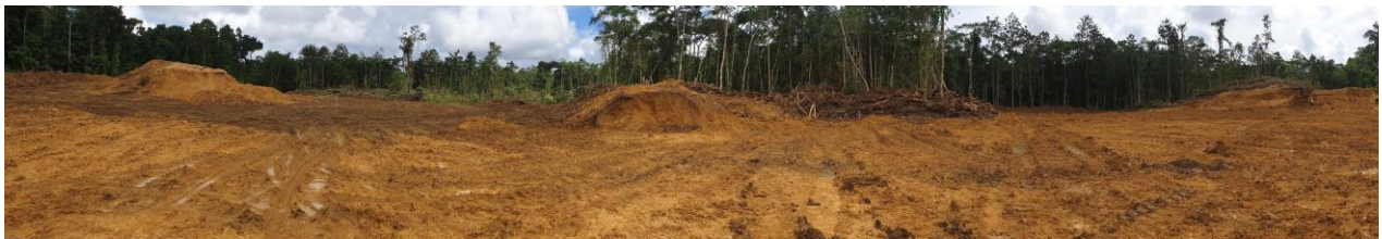
Figure 4: Panoramic photograph of plant clearing, 60% complete as at 30 January 2020