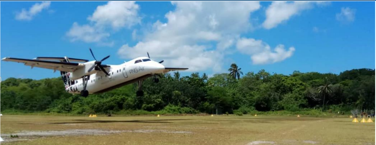
Figure 5: Geopacific personnel arrive on Woodlark Island via PNG Air, the largest aircraft to visit site since World War II.