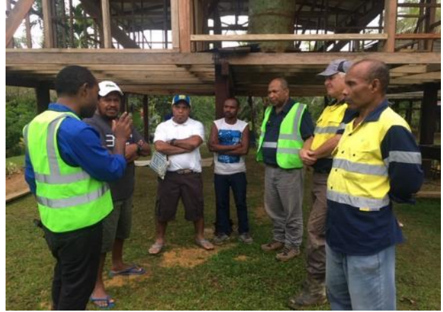
Figure 7: Community consultation and engagement has been extensive and ongoing