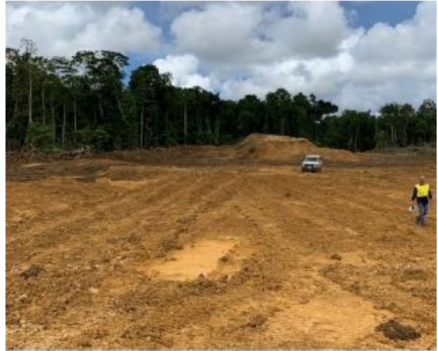
Figure 3: Plant Site Clearing and Grubbing