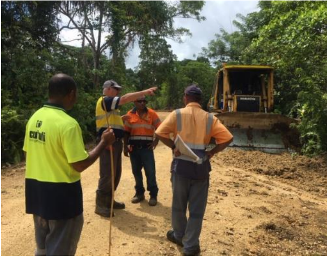
Figure 2: Port Road Clearing

As at 30 Jan 2020, 60% of the plant site has been cleared and grubbed with levelling currently underway. For the port access road, 2.5 km of the 7km has been cleared and forming works are ongoing.