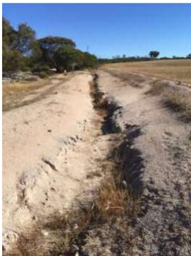
Figure 2: Erosional gully exposing outcropping kaolinic profile at surface