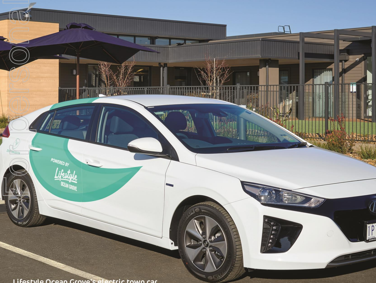
Lifestyle Ocean Grove's electric town car