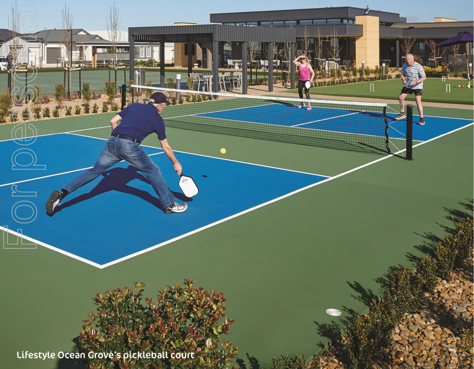
Lifestyle Ocean Grove's pickleball court