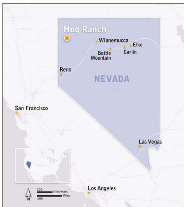
Figure 1: Regional location diagram of the Hog Ranch Property, Nevada USA.

Rex has currently identified two main projects areas, the Krista Project (Krista) to the north and the Bells Project (Bells) to the south (See Figure 2). Historically, ore was mined from five pits to the north (in the Krista Project area) and 1 pit to the south (the Bells Project area) for a total of six pits.