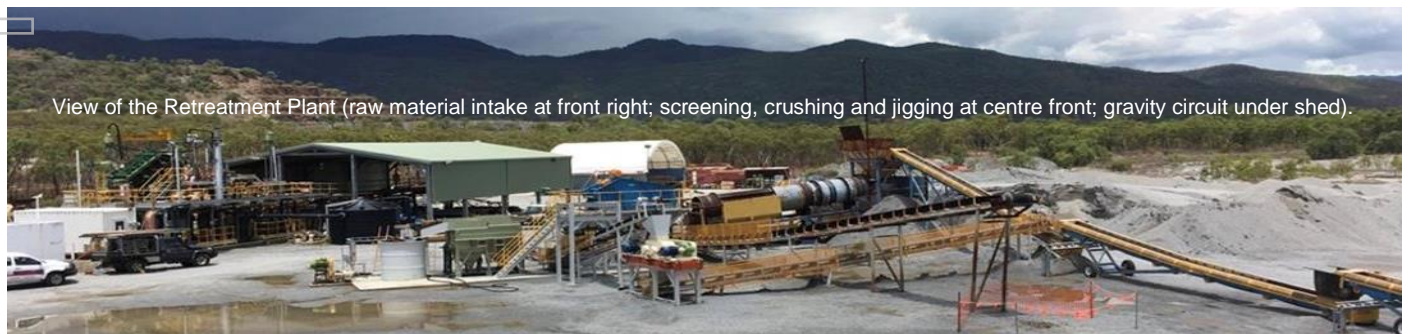
View of the Retreatment Plant (raw material intake at front right; screening, crushing and jiggling at centre front; gravity circuit under shed).

On-site staff have been working throughout January 2020 to optimise processes to achieve longer sustained production throughput at increasing plant feed rates and it is intended that production will move to a 24-hour, 7 day a week, basis during the month of February 2020.