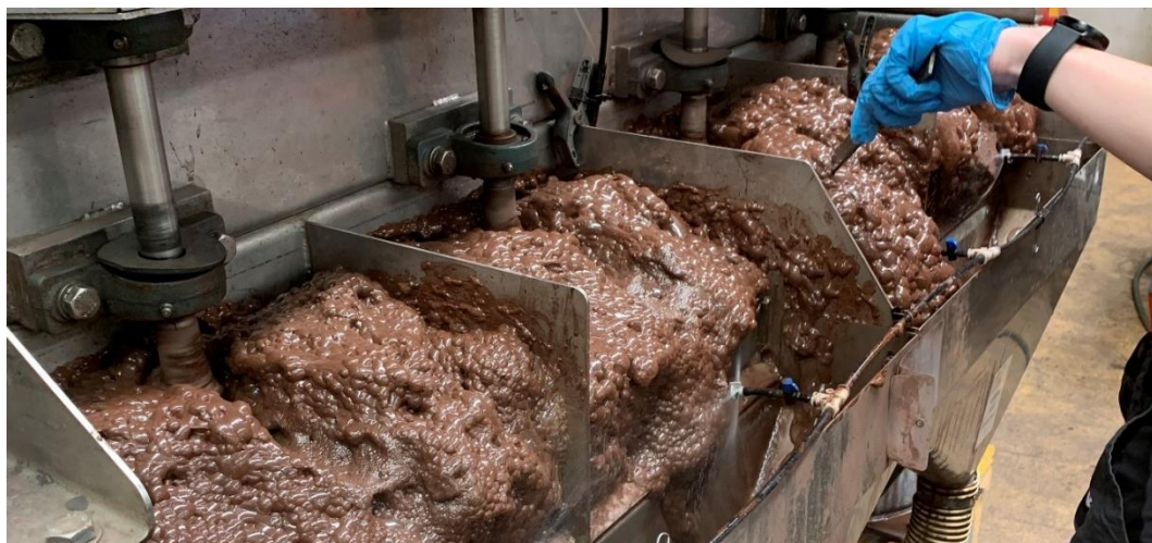
Figure 4 - Reverse Silica Flotation Circuit Pilot Test

Reverse silica flotation, the final step in the Project flowsheet, is displayed in Figure 4 below. This polishing step has proved to be critical in the production of high quality, low silica concentrate.