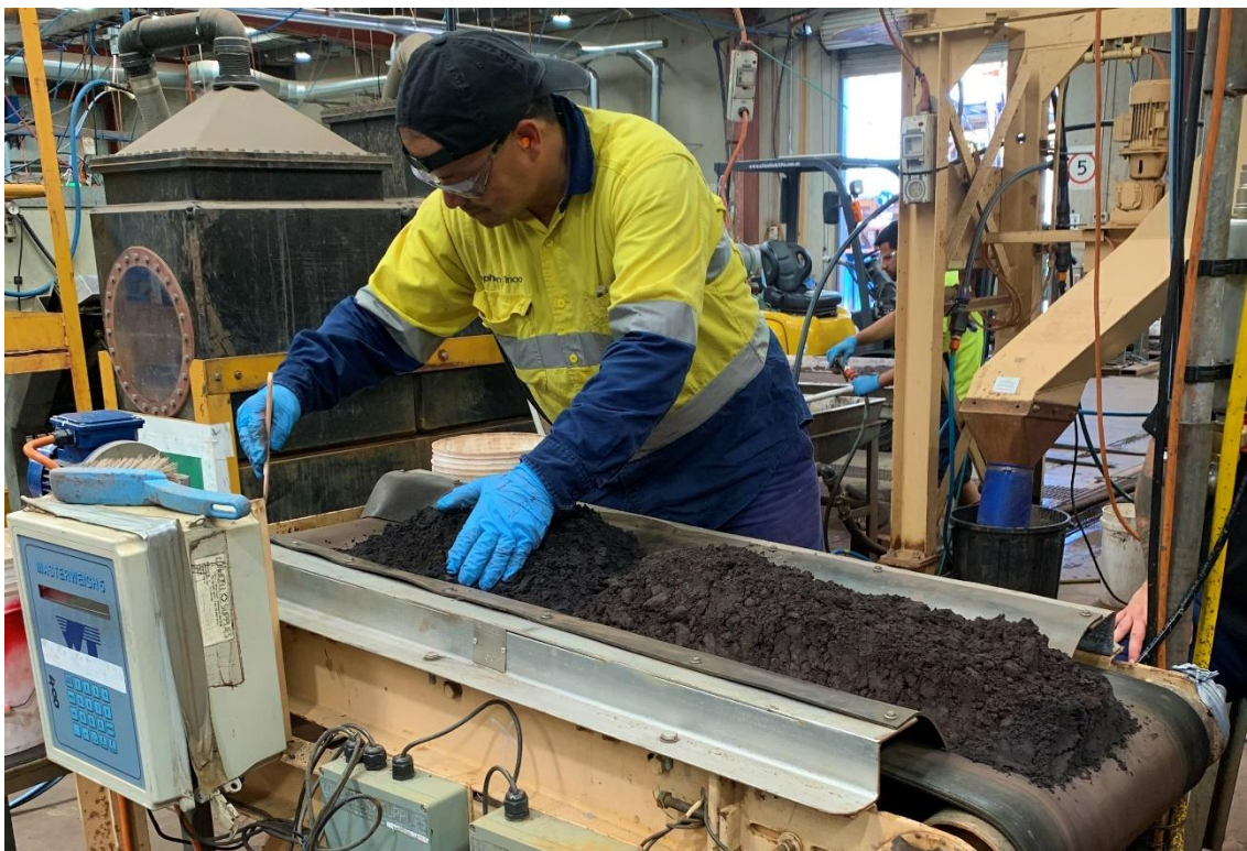
Figure 1 - Magnetic Concentrate Feed to Regrind Mill

'A key indicator of success in bringing a project into production is a full understanding of the ore body and how it behaves and the processing methodology that will be used. Test work begins at bench scale in the laboratory and once the process has been proved at that scale, a larger set of tests are undertaken to ensure that when the project is built at full scale it will work properly. During the test work at bench and pilot scale lessons are learnt and modifications are made to the circuit and re-tested and refined until the process is ready for full scale. This is the reason that AVL is taking so much care to do this work properly and reduce risk down the track.'