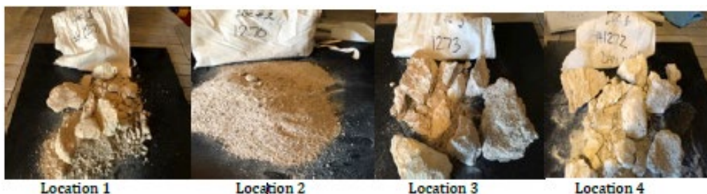
Figure 1: 13 Samples taken from 4 locations sent to First Test Minerals

A total of 13 samples were taken from the Noombenberry project site which exhibits outcropping across an area of approximately 50km 2 .