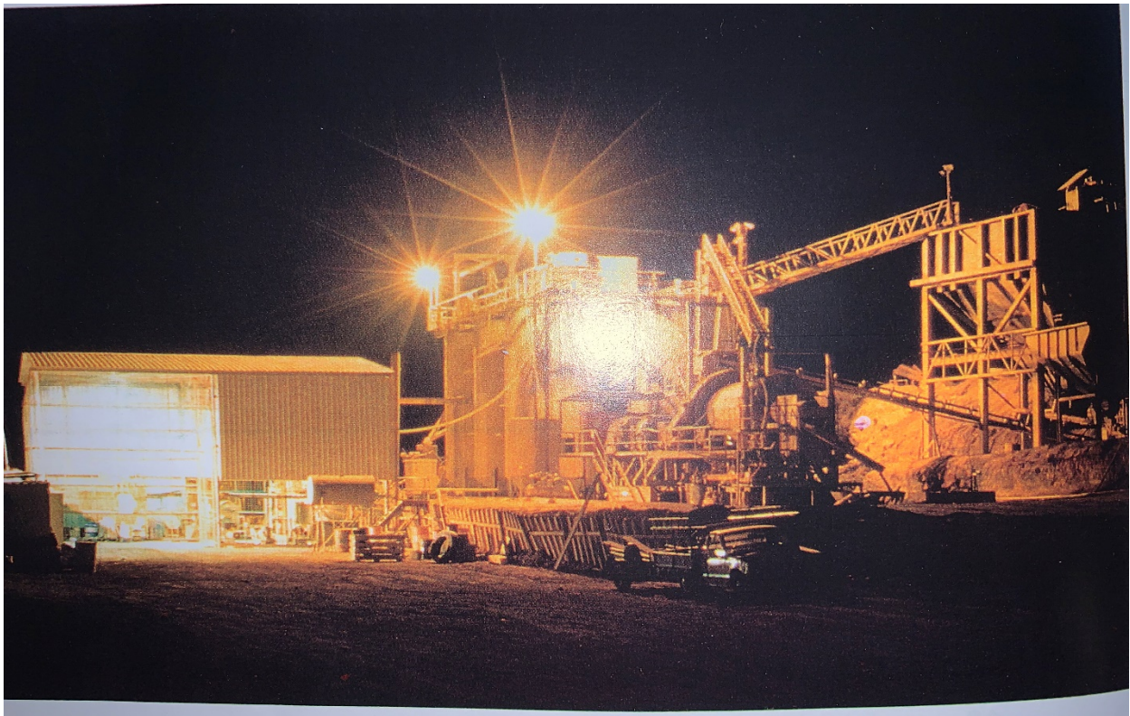
Figure 2. Previous operations at the Mt Freda Open Cut gold mine, 1992 Cloncurry QLD. (Mt Freda Gold Mine previously produced ~120,000 Oz Gold averaging 4 g/t Au from 1988-1992)