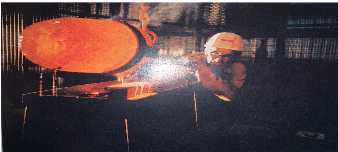
Figure 1. Gold Pour 1992, Mt Freda Open Cut gold mine, Cloncurry QLD.