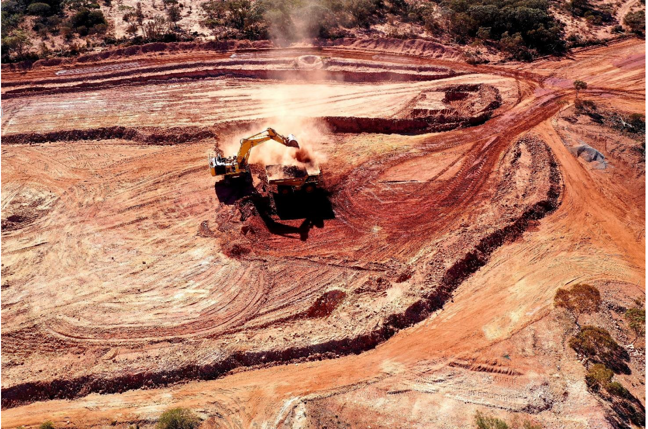
Figure 4: Boorara Stage 1 Aerial view of the Regal East open pit

Authorised for release by the Board of Directors