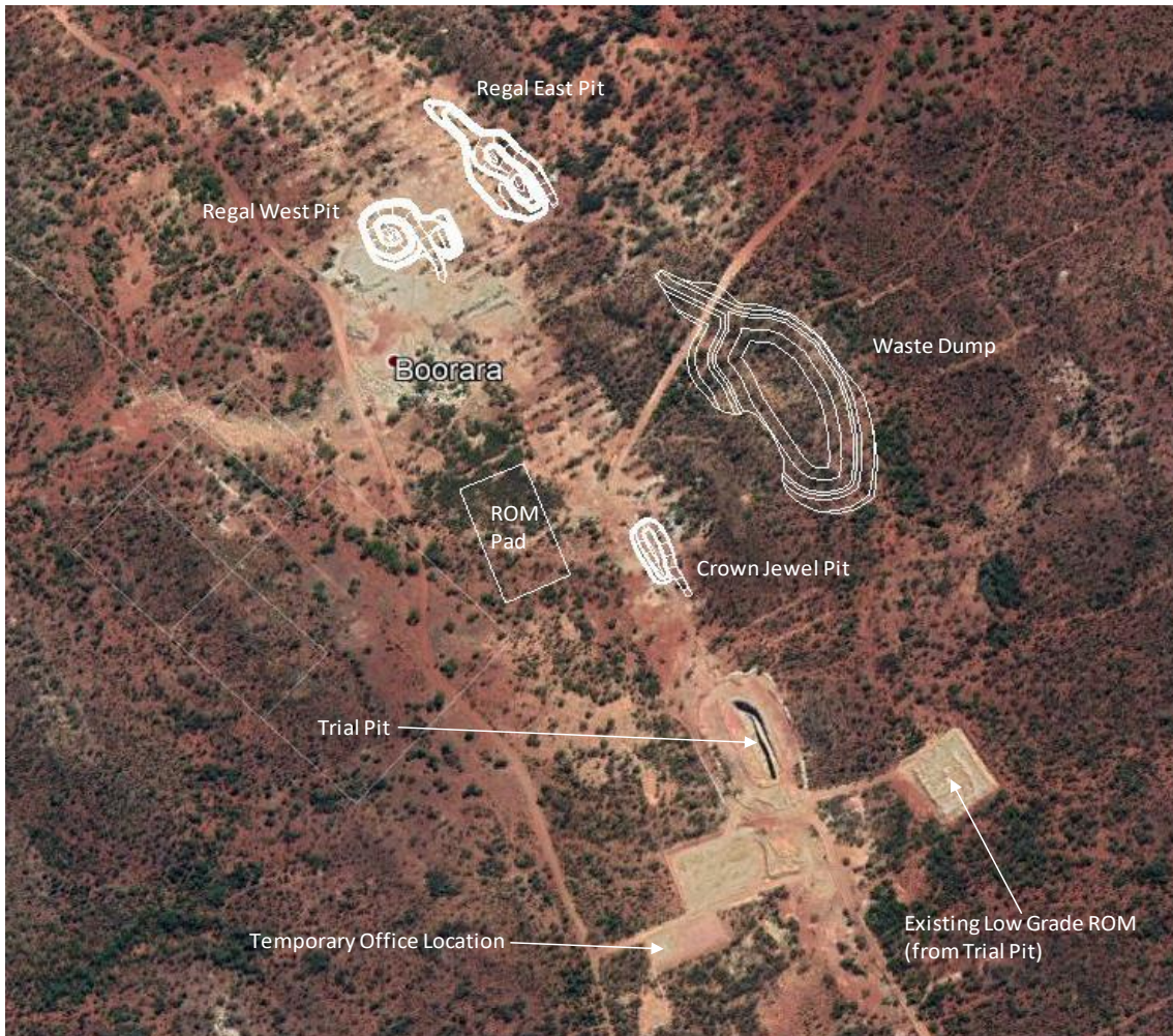
Figure 3: Boorara Stage 1 site layout

Ore will be hauled on existing roads to Golden Mile Milling's Lakewood processing plant with an Agreement in place for treatment of the ore mined 1 . Treatment will be completed on a monthly campaign basis under Horizon supervision, with the first gold production scheduled for July 2020 2 .