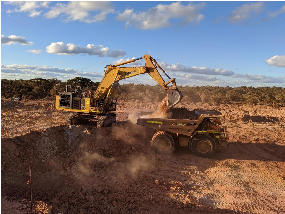
Figure 2: Mining underway at the Regal East open pit

Locally-based contractor Hampton Transport Services Pty Ltd have been awarded the mining and haulage contracts to complete the works. Site establishment and fleet mobilisation is now complete with open cut mining underway in the Regal East pit using conventional truck and shovel operations (Figures 2 and 4).