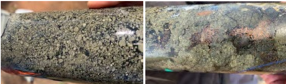
LHS: Coarse pyrite in skarn @ 64.5m.

Targeted geological setting of adjacent porphyry to near surface skarn confirm in first hole, analogous to Cadia and multiple Tier 1 porphyries