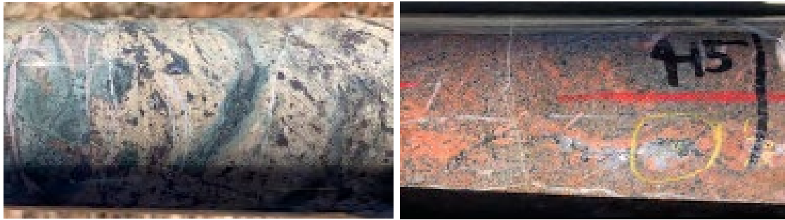
LHS: Qz-Ch-Ser altered skarn with patchy chalcopyrite & bornite @ 286m