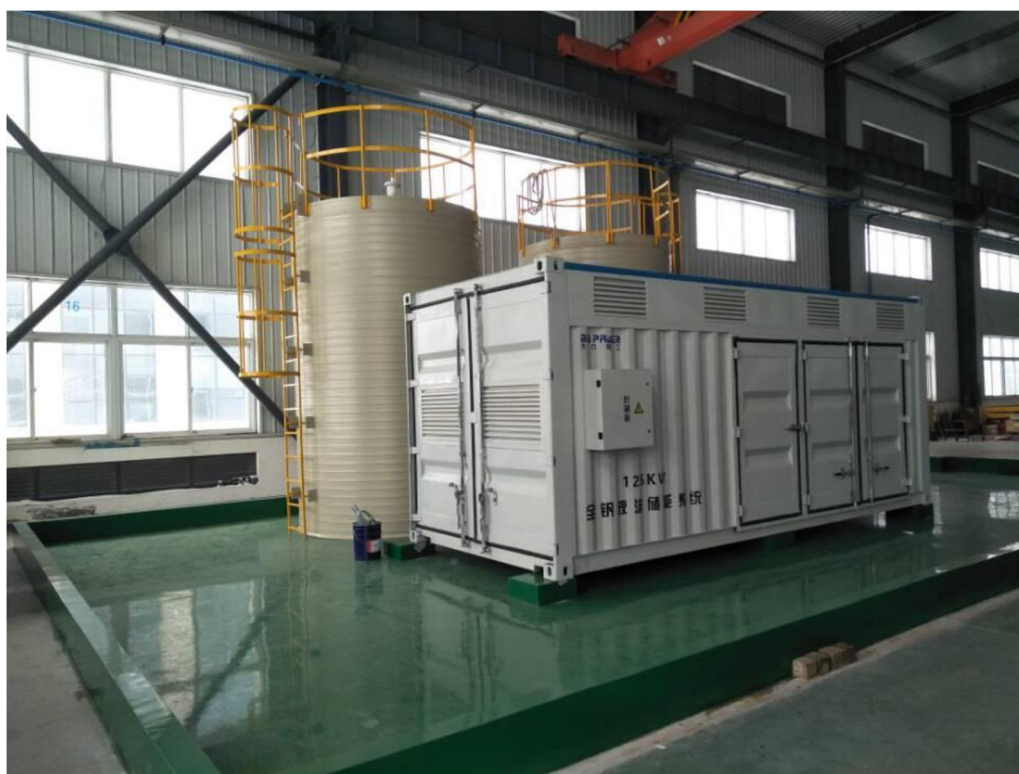
Figure 1: Big Power VRFB System at Xiangyang Used for Peak Shifting

The JV contemplated in the MoU provides the scope to bring together Big Power's world leading proprietary VRFB technology and TMT's very high purity product to establish a significant downstream value add industry, producing vanadium electrolyte and potentially developing a VRFB manufacturing base to target the rapidly emerging stationary storage battery market opportunities in Australia. This opportunity further enhances the significant economic and social benefits for the Mid-West region of Western Australia, the State and the Nation that the development of Gabanintha is expected to generate over a long period of time.