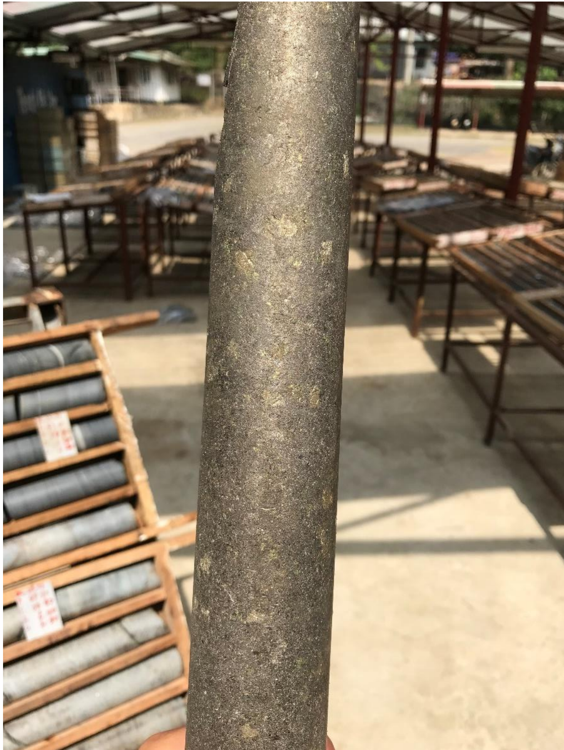
Figure 2: Blackstone's maiden Ban Chang drillhole BC20-03 intersects massive sulfide.

The drilling is part of an ongoing campaign to target regional MSV as Blackstone aims to build its resource inventory at Ta Khoa. Blackstone's second drill rig will continue to follow the in-house geophysics team throughout the Ta Khoa nickel sulfide district, testing high priority EM targets generated from 25 MSV prospects including King Snake, Ban Khoa, Ban Chang, and Ban Khang.