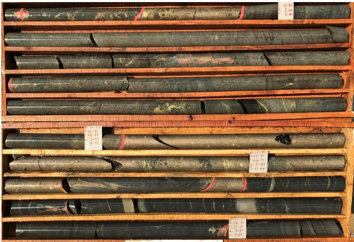
Figure 1: Blackstone's maiden Ban Chang drillhole BC20-03 intersects a 9.15m wide zone of sulfide vein mineralisation.